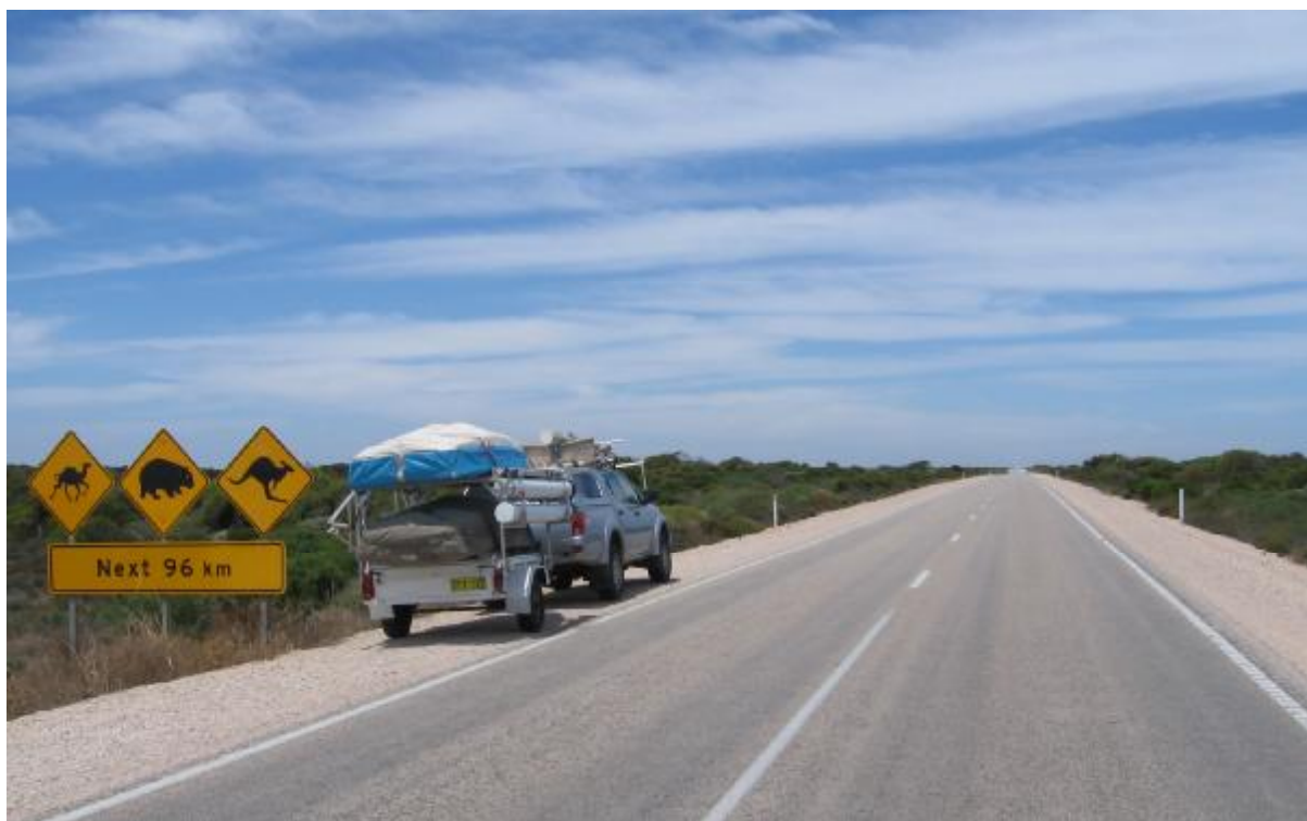
Mirrors on the road to Nationals in Victoria