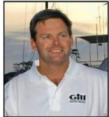
FLYING FIFTEEN WORLD CHAMPION

YACHT RIGGING & SPLICING BOAT MAINTENANCE & DETAILING YACHT FITOUTS & MANAGEMENT HARDWARE SERVICING RACE PREPARATION & TUNING WORLD CHAMPION FLYING FIFTEENS BALUSTRADE / TRELIS WIRES