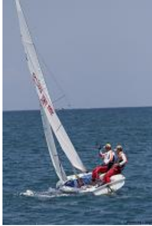
Above Philippine sailors in their 470